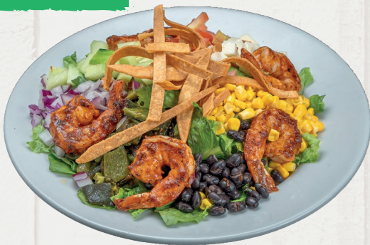
PUEBLO GRILL BOWL

Grilled chicken over a bed of romaine lettuce garnished with shredded cheese and croutons.