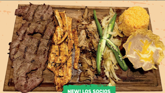
NEW! LOS SOCIOS

Slow roasted beef shank basted in guajillo-mezcal sauce. Served with rice, beans and green sauce.